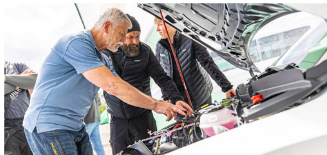
Petr Pavel, President of the Czech Republic, took a closer look at the Škoda Fabia RS Rally2.